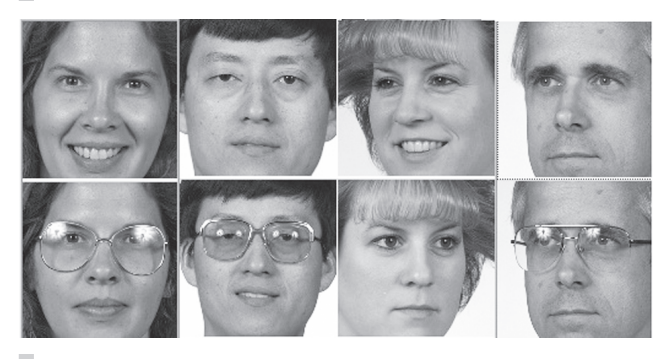
Fig. 2. Examples of facial images selected from the Feret database

In experimental researches a cross-validation procedure is used which averages the recognition rates obtained while classifying the set of images into training and test sets. The training set images are randomly selected from the ORL database. All remaining images have formed the test set. Ten experiments are performed per each series. In paper [13] experimental researches of normalized images from the ORL database have been performed using the following different methods: PCA (Principal Component Analysis), LDA (Linear Discriminant Analysis), DLA (Discriminative Locality Alignment [14]), NDLPP (Null Space Discriminant Locality Preserving Projections [15]), RLPDA (Regularized Locality Preserving Discriminant Analysis [13]).